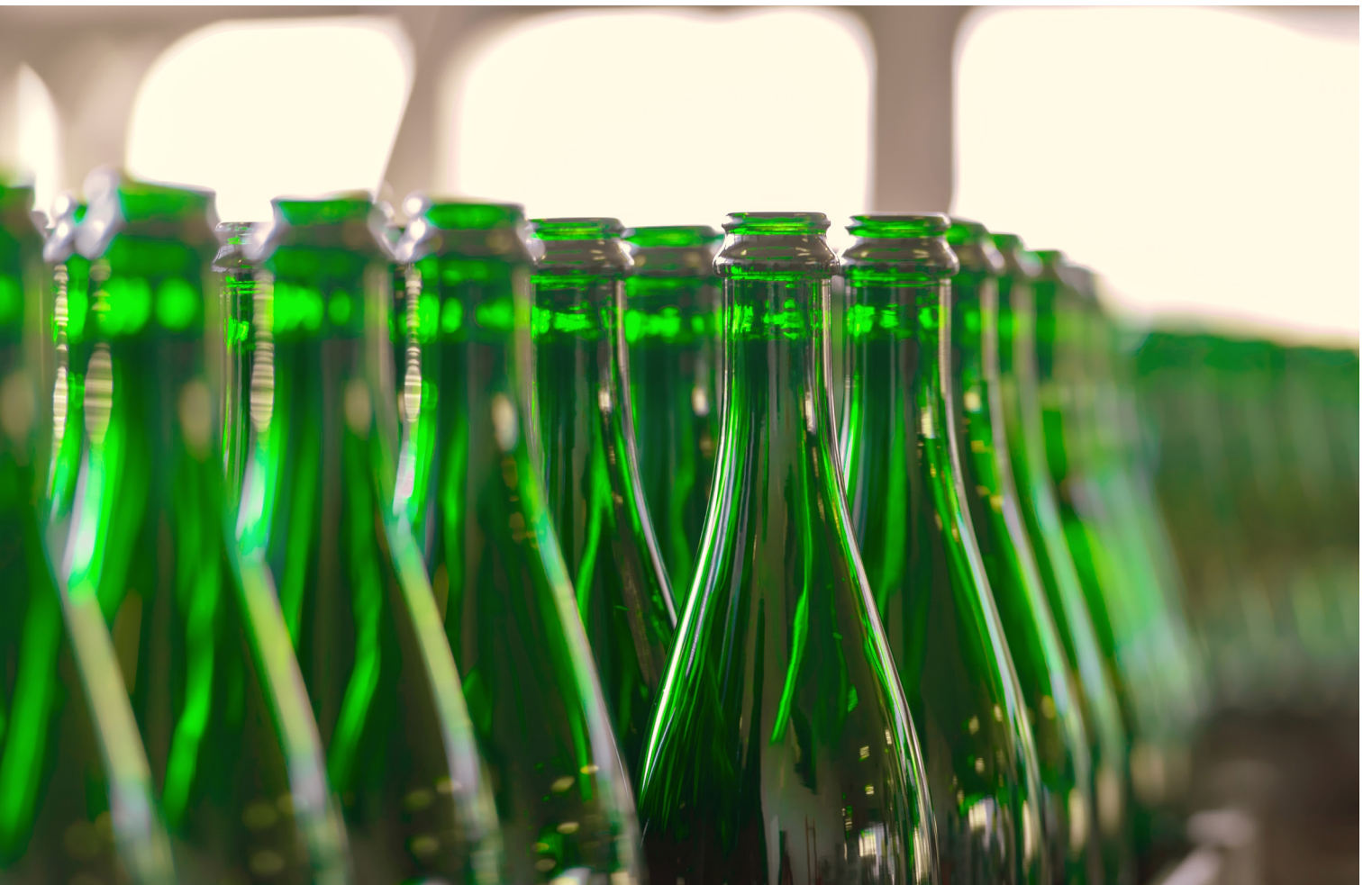
ABB Power protection solutions Food and beverage industry